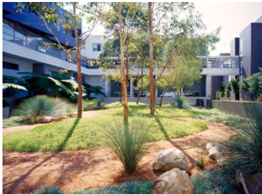
COMBINATION OF GRAVEL, GRASS AND NATIVE PLANTING IN COMMUNAL SPACES