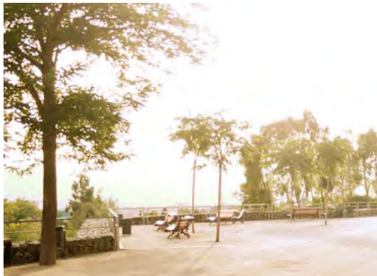
TREES AND SEATING IN GRAVEL WITH EXISTING LOW WALLS AT BUSHLAND INTERFACE